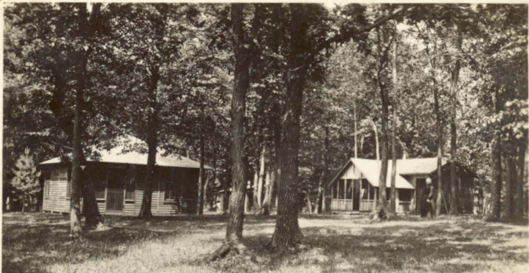
23 COTTAGES AT HAZELMER'S FAIR, ONT. MOUNTAIN